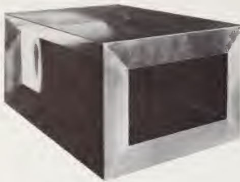
Donald Judd, Untitled , 1968

Smith went so far as to remark, "I don't make sculpture, I speculate in form." Purged from art were all storytelling and social commentary—as well as the belief in spontaneous gesture as encoded emotion, a hallmark of 1950s Abstract Expressionist painting. Concept and process reigned over feeling. Cool, precise icons of formalism filled pristine, white-walled, and artificially lit exhibition spaces.